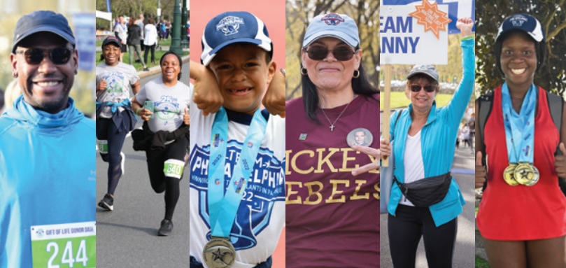
Some of our shining stars from the 2022 Transplant Games and 25th Anniversary Donor Dash.

Thanks to your generosity and support, together we shine and save lives!